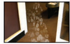
LESS SALT-TRACKING INSIDE BUILDING!

Applied by Our Pre-Storm Team*, MELTDOWN